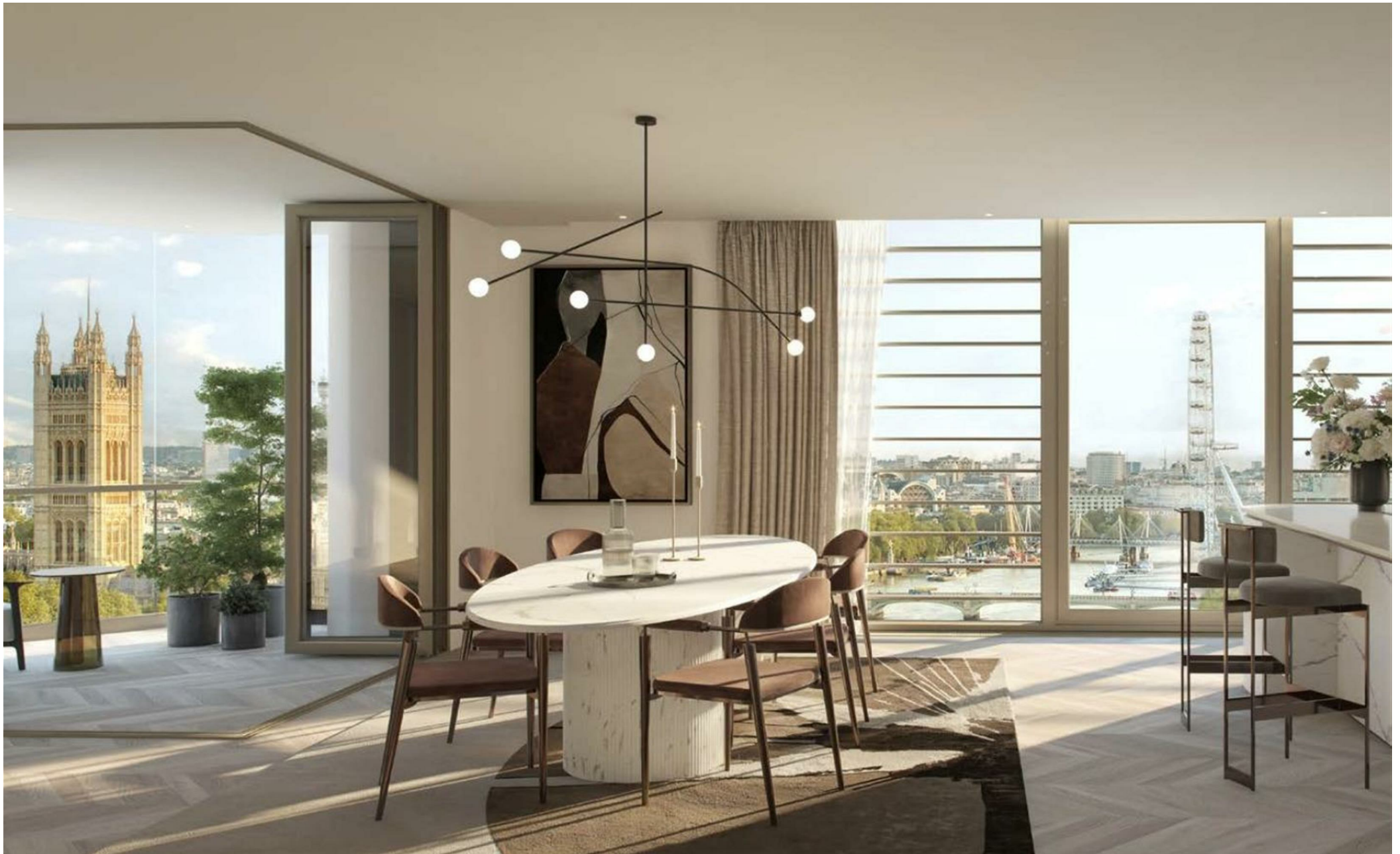
Flat 1201, Westminster Tower 3 Albert Embankment, London, SE1 7SP £5,350,000